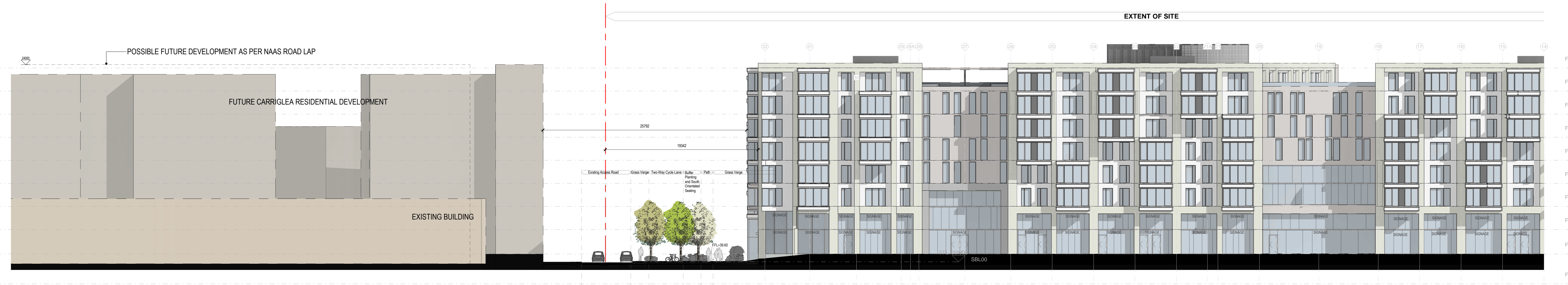
6 Contiguous Site Elevations - North 06 1 : 200

P01 | 18/01/19 | AB | Issued for Planning